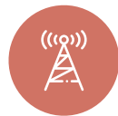
Technology, media & telecoms (TMT)